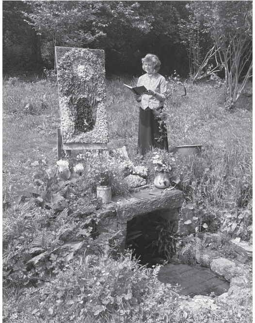
Blessing the well at Newhouse Farm