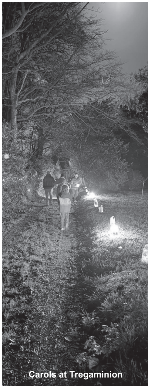
Carols at Tregaminion